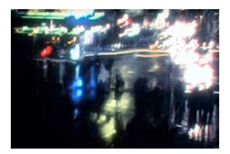
NIGHT WALK: Fabienne Gautier (France/Paris), 5:00 min, 2004 Color Super 8 to DV, 7 min. An improvised walk through Paris at night. Exercise in color and abstraction emanating from the city's ethos.

'Corps' was shot in a single winter night in London from just after people quit work until late. London becomes a dance as in "corps de ballet", and a study of the individual human body within this -"corps".