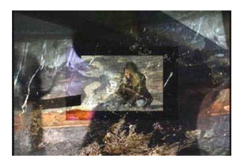
Salt: Christina McPhee (USA/LA), 9:00 min, 2004

Post San Simeon earthquake nightmare and reflections on San Andreas Fault salt bed. SALT is born of the 6.5 magnitude San Simeon earthquake of December 2003. The night of the quake, McPhee recorded mass media's take on the destruction – television's six o clock lineup. Amid dismal reportage, an antagonist appears, taking recordings and drawing in the dry salt of Soda Lake.